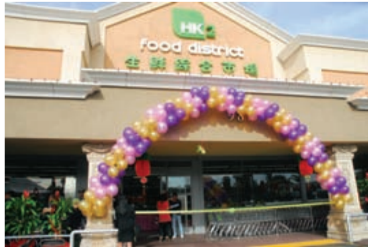
The face of the latest Hong Kong 2 Food District Market.